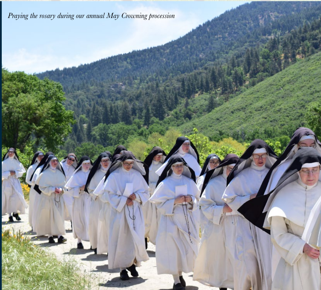
Praying the rosary during our annual May Crowning procession

On the Cover: The Immaculate Conception , by Esteban Bartolomé Murillo (c. 1670)