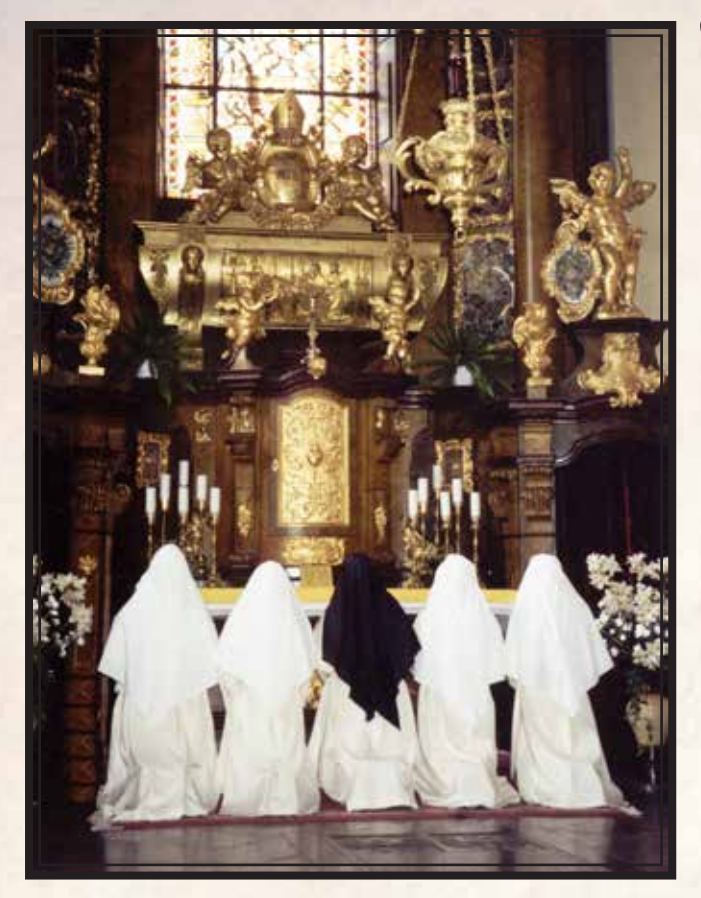
From our Archives: 1999 - Mother and the other four founding nuns kneel before the tomb of St. Norbert at the Norbertine Monastery of Strahov, in Prague, Czech Republic, during the beginning days of the founding of our community.

On the Cover: Detail of a stained glass window made by our sisters and installed in our chapel July 11, 2021 (see also events page).