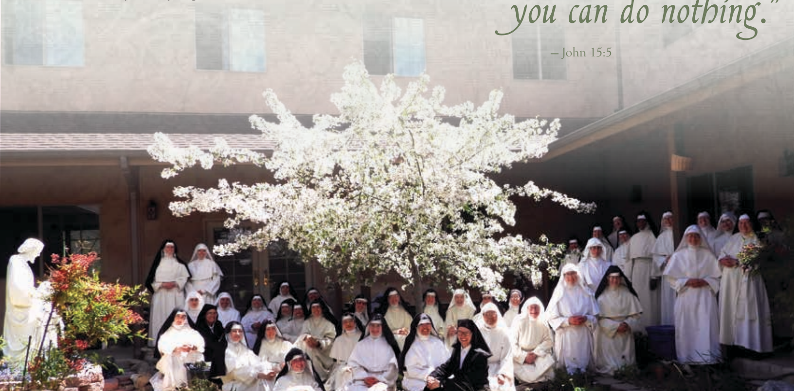
OUR COMMUNITY — SPRING 2019