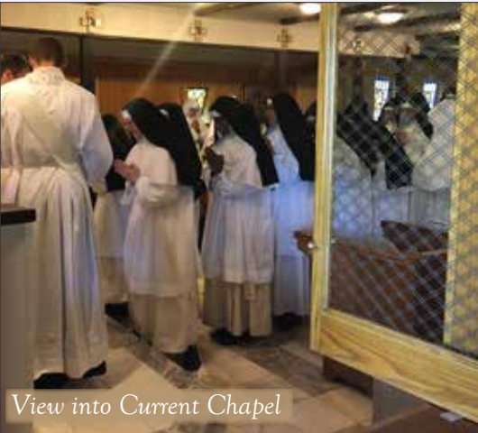
View into Current Chapel

OUR VISION Our still eager nun, now a junior professed, is preparing for the day when she will become a canoness