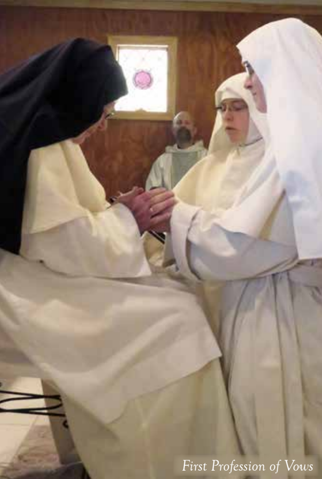
First Profession of Vows