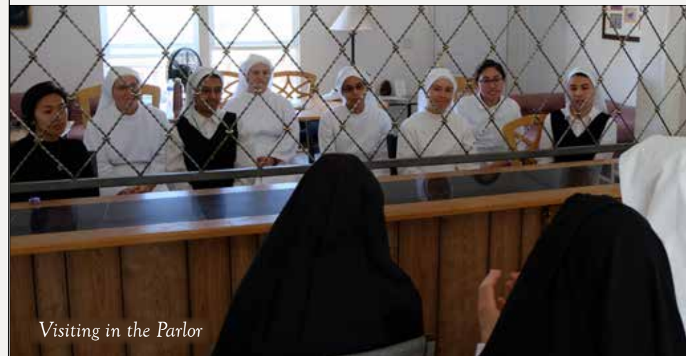
Visiting in the Parlor