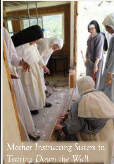
Mother Instructing Sisters in Tearing Down the Wall

BURSTING AT THE SEAMS We have never turned away a vocation due to lack of space – we welcome them as God’s gift to us and to His Church, and somehow find room. Back in 2011, an eager aspirant watched five women enter within three months. Waiting until she would be old enough to enter, she peered into our little chapel, which was bursting at the seams, and began to worry, “Will there still be room for me?” With some creativity, we did make room for her—two nuns moved onto folding chairs in a narrow hallway outside the chapel.