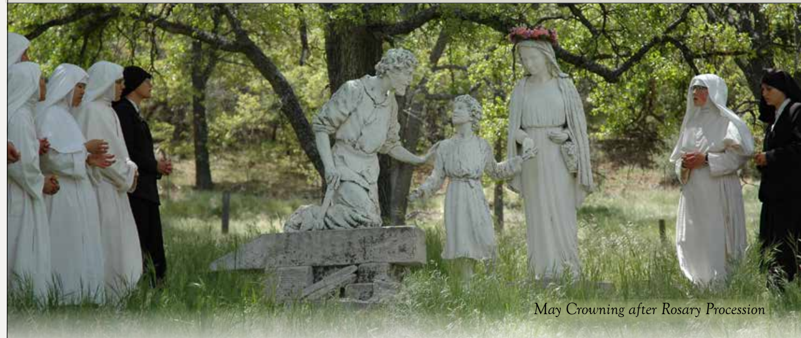
May Crowning after Rosary Procession

Spring at the Bethlehem Priory is a beautiful time.