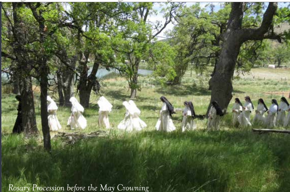
Rosary Procession before the May Crowning

Please kindly help us update our address & email database by sending us your current information.