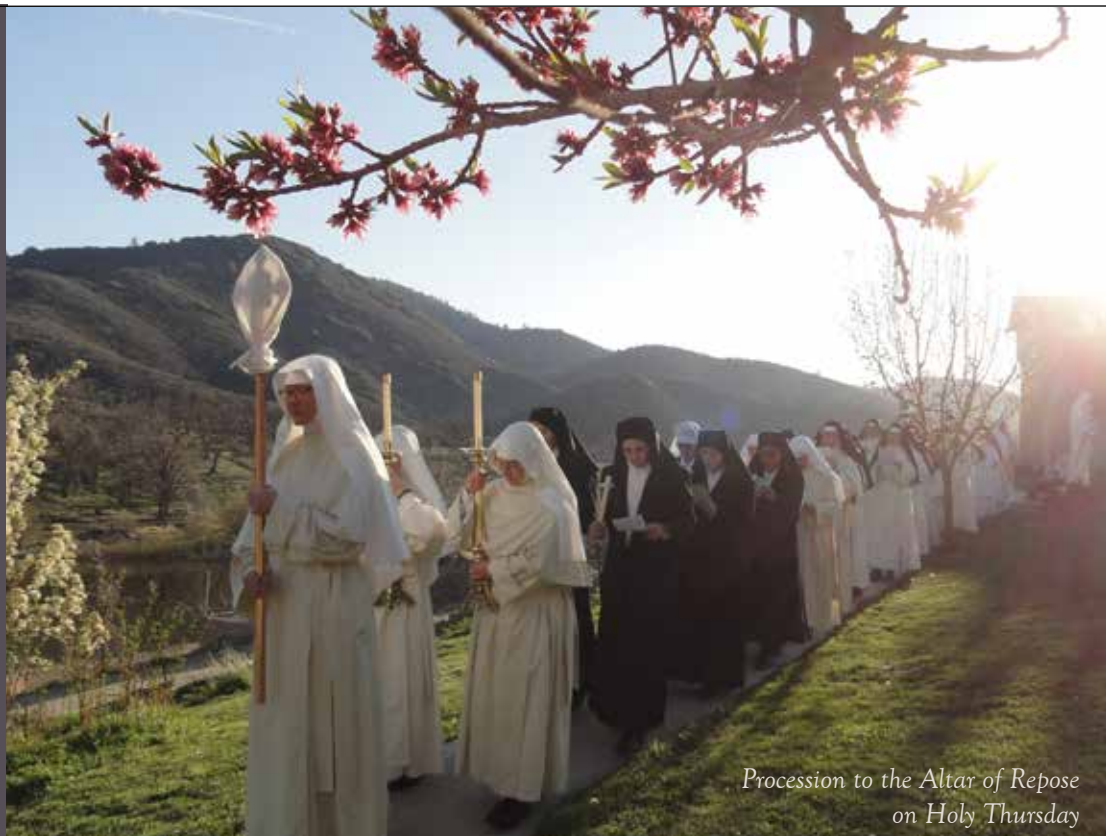
Procession to the Altar of Repose on Holy Thursday

On the Cover: The 130-year-old, German-crafted stained glass window depicting Our Lord's Crucifixion, Resurrection, and Ascension will serve as the centerpiece of our future chapel. It will be mounted high behind the altar, from which the sacraments of the Paschal Mystery flow and where the Norbertine Canonesses gather day and night together to celebrate the Sacred Liturgy. Just as the altar is the center of the church, so, too, it is the altar and center of the life of the Norbertine Canoness, where she daily offers herself with her Spouse in sacrifice for the glory of the Father and the salvation of souls.