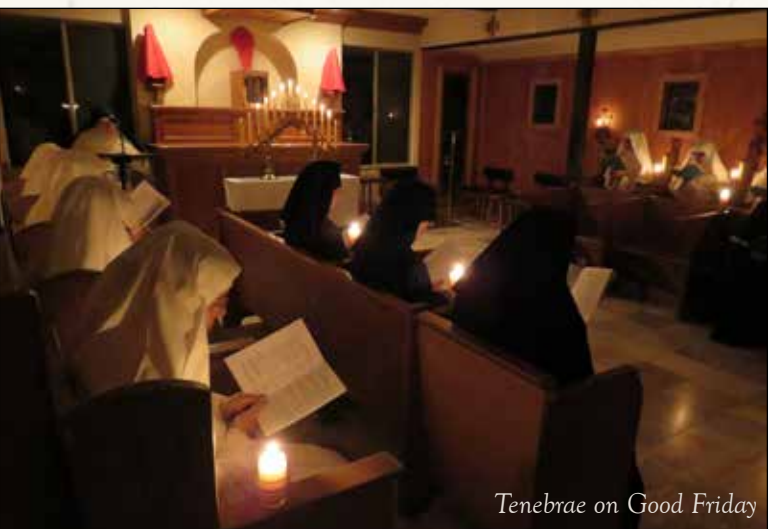
Tenebrae on Good Friday