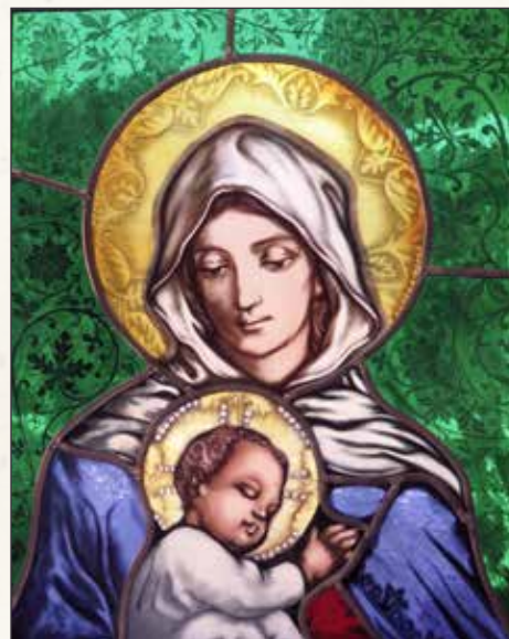
Stained glass window made by the Norbertine Canonesses