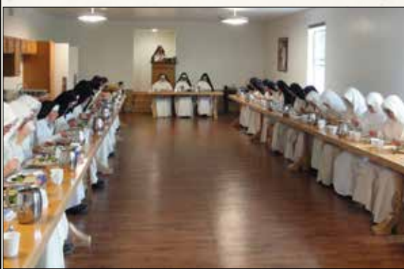
Top to bottom: Entering the cell, working in the kitchen, prayerful contemplation during grand silence in the garth, sharing supper in the refectory