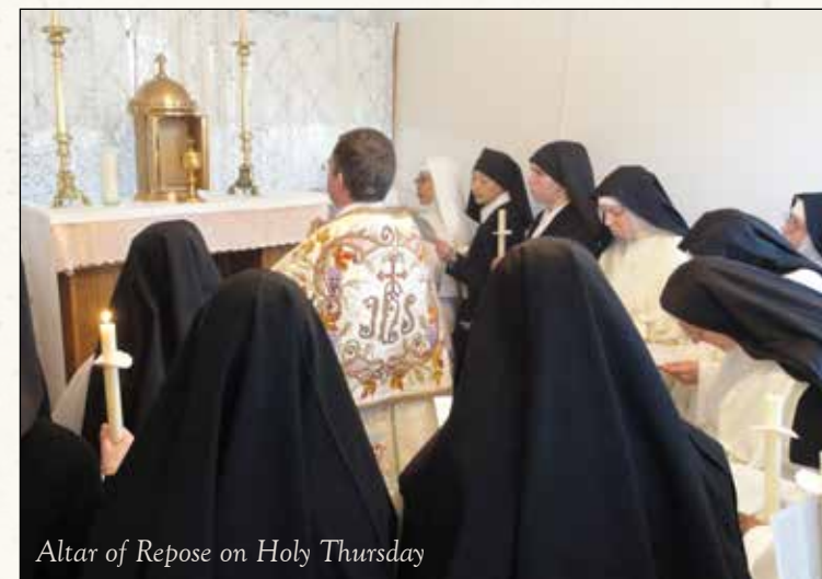
Altar of Repose on Holy Thursday

Finally, as "in all religions, sacrifice is at the heart of worship... now sacrifice takes the form of the Cross of Christ, of the love that dying makes a gift of itself. Such sacrifice has nothing to do with destruction. It is an act of new creation, the restoration of creation to its true identity. All worship is now a participation in this 'Pasch' of Christ, in His 'passing over' from death to life, to the unity of God and man. Thus, Christian worship is the practical application and fulfillment of the words that Jesus proclaimed on the first day of Holy Week, Palm Sunday, in the temple of Jerusalem: 'I, when I am lifted up from the earth, will draw all men to myself' [JOHN 12:32]." — Pope Emeritus Benedict XVI, excerpt from The Spirit of the Liturgy