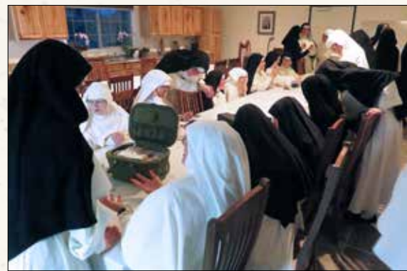
Top to bottom: Reading the Church's Martyrology at daily Chapter, waxing cheese in the milk kitchen, studying in the Novitiate, evening of common recreation