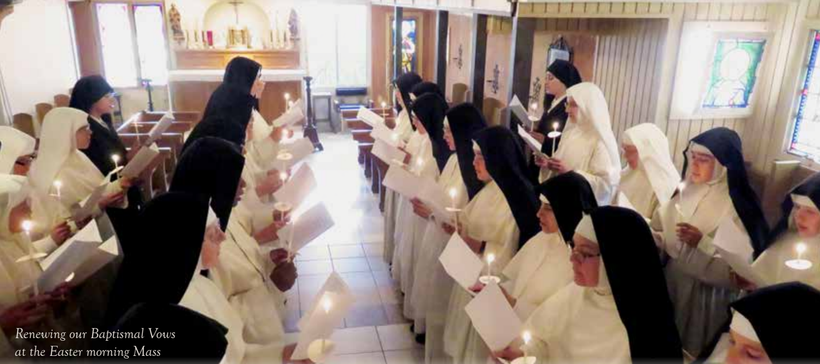
Renewing our Baptismal Vows at the Easter morning Mass