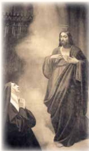
Our Lord appears to St. Margaret Mary

The revelations of Our Lord to St. Margaret Mary Alacoque in the 17th century provide a beautiful reflection on devotion to the Sacred Heart and its integral relation to the Holy Eucharist. Not only did Our Lord's "great apparitions" occur when the Saint was praying before the Blessed Sacrament, but the subject of His revelations were all about the Eucharist. The Lord spoke of the ingratitude and insults He received in the Blessed Sacrament, asking for acts of love, adoration, thanksgiving and reparation. He requested that the Friday after Corpus Christi be instituted as a special feast in honor of the Sacred Heart (leading us liturgically from the Eucharist to His Heart), and First Friday devotions to the Sacred Heart be instituted, involving the receiving of Holy Communion and keeping a Holy Hour with the Blessed Sacrament exposed.