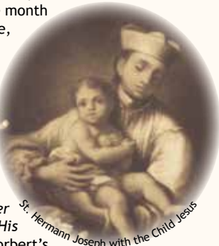
St. Hermann Joseph with the Child Jesus

It is therefore no surprise that the feast day of St. Norbert, Apostle of the Eucharist, is found in the month dedicated to the Sacred Heart. His life, centered on daily holy Mass and the Eucharist, manifested his profound belief that Jesus - Body, Blood, Soul and Divinity - is present in the Eucharist, which includes His Sacred Heart. "The faithful bear witness to and solemnly avow the faith of the Church that the Word of God is identical with the Son of the Virgin Mary, who suffered on the Cross, who is present in a hidden manner in the Eucharist, and who reigns upon His heavenly throne." [Mediator Dei] Indeed, Norbert's reparation after the Tanchelm heresy in the 12th century may be seen as a response to the call of the Sacred Heart, a call which transcends time, with Norbertines from and since the days of our holy founder embracing our rich spiritual heritage, continuing through our way of life Norbert's deep devotion to the Eucharistic and Most Sacred Heart of Jesus.