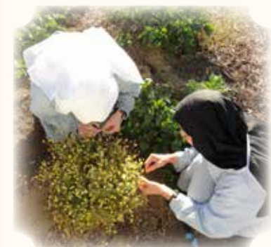
Picking chamomile flowers to dry and make into tea bags for the upcoming "Un-Tea Party" invitations.