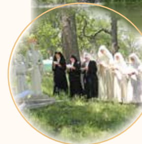
(ABOVE) The Rosary procession to our outdoor Holy Family statue during the annual May Crowning on the feast of the Visitation, May 31st. (LEFT) Chanting Sext.

At the Solemn Profession reception, Mother helps the three new "Brides of Christ" cut their wedding cake. While the entire community was not present at the reception due to our cloistered vocation, the three newly-professed sisters were able to attend and thank family and friends for their support and prayers.