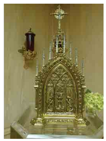
Thank you to our friends who gave to our community an exquisite tabernacle and number of sacred vessels, as well as fine religious statues and furnishings.