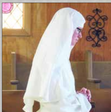
Top, Left to Right: Milking cows; Receiving Holy Communion; Working in the garden At Left: Praying in the choir; Tilling the ground