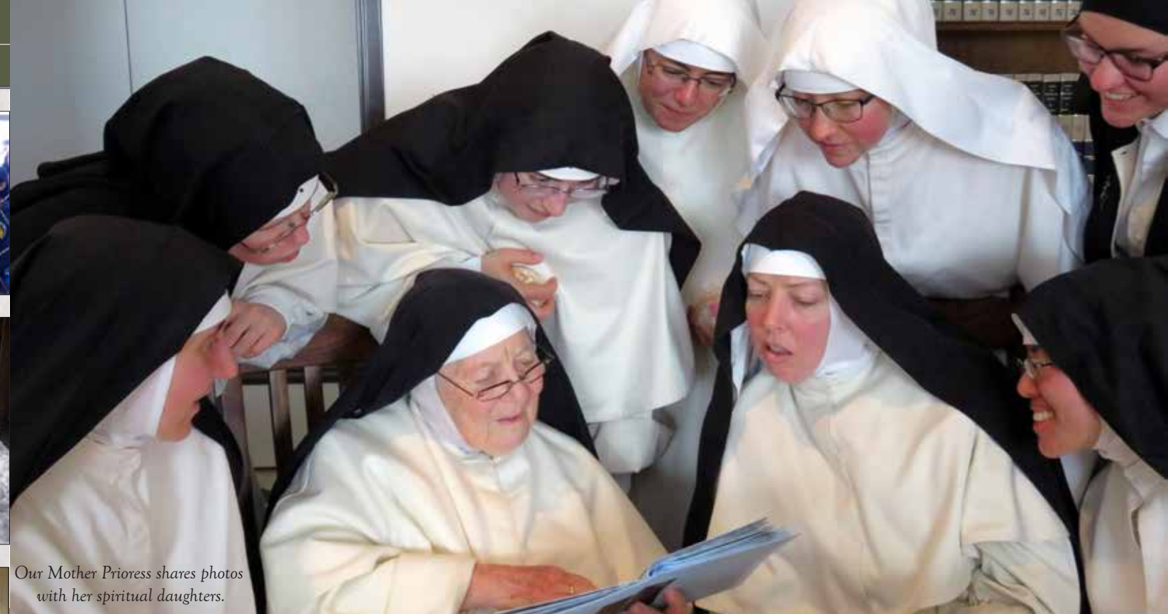
Our Mother Prioress shares photos with her spiritual daughters.