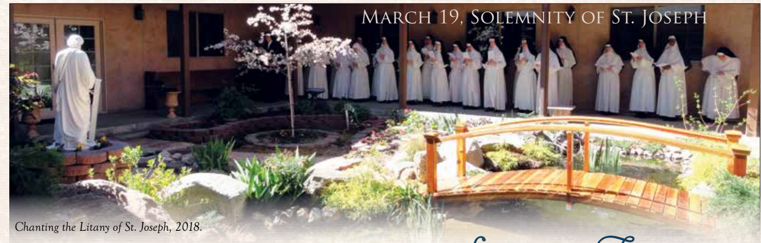
Chanting the Litany of St. Joseph, 2018.