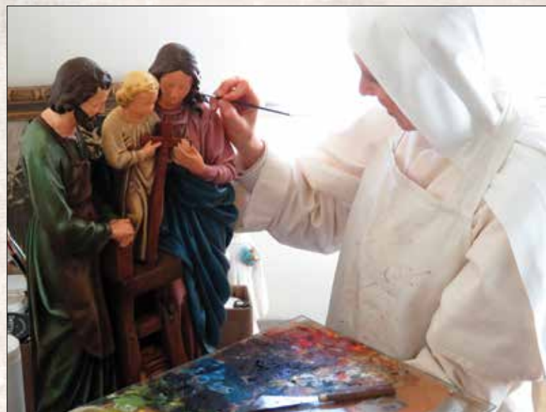
Painting a statue of the Holy Family for a gift shop order.

“Whoever does the will of my Father is my brother, and sister, and mother” (Matthew 12:50). Far from rejecting motherhood, the consecrated woman, faithful to her vocation, lives the reality of motherhood in a profound way. Through her complete “fiat” to God — in union with Christ in His mission of doing the Father’s will (John 6:38), and that of the Blessed Virgin Mary’s total and life-long “fiat” begun at the Annunciation — she is called to bring forth divine life in her spiritual children. The consecrated virgin, by her total “Yes” to God, realizes her call to maternity by being the Mother of Christ in souls, a fecundity that transcends the natural, and which, with God’s grace and infinite divine mercy, bears supernatural fruit, in time and unto eternity.